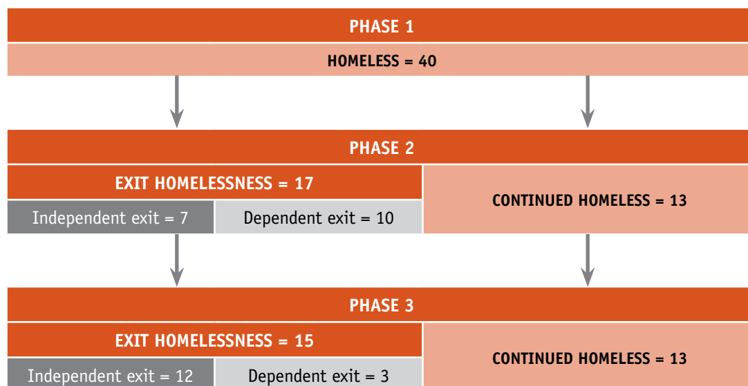
Figure 1: Homeless pathways – Phases 1, 2 and 3

In any reading or interpretation of the homeless and housing transitions presented in Figure 1, it is important to caution that not all Phase 2 participants were retained at Phase 3 and that a number who were not interviewed at Phase 2 re-engaged with the study at Phase 3. Thus, this diagrammatic representation does not claim to ‘follow’ precisely the same young people through Phases 2 and 3 of the study. 9 Nonetheless, despite a time lapse of between 3 and 4 years, the picture remained remarkably similar in terms of the total number who remained or, alternatively, had exited homelessness at Phases 2 and 3 of the study, respectively. In other words, the broad patterns of movement either out of homelessness or towards more chronic homeless states remained relatively stable for the sample over time. These patterns are significant in that they point to early transitions out of homelessness as generally sustained and sustainable, and, conversely, to the absence of early exit routes as prolonging young people’s homeless ‘careers’.